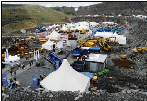
Steinexpo exhibition area Plenty of space and a genuine environment offered the quarry Nieder-Ofleiden in the centre of Germany.

Partner regions of steinexpo 2008 were Central and East Europe. UEPG welcomes this focus as its membership includes Czech Republic, Poland, Romania, Slovakia and Turkey and is striving for expansion to Baltic States, Bulgaria, Hungary and Ukraine in particular.