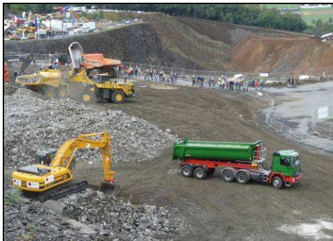
Demonstrating the complete production process Extraction, processing, transport and consignment at the steinexpo 2008.