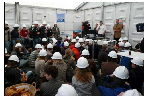
Attracting young people to the industry Students visiting steinexpo 2008 interested in the work of an engineer.

Results regarding the number of visitors were better than previous expectations of 32,000. Steinexpo 2008 attracted 250 exhibitors and 43,280 visitors demonstrating machinery in action in a quarry from 3-6 September. The increase of exhibitors and branches of 16% and a 35% increase of visitors is the result of the successful concept of organisers. Visitors appreciated the complete demonstration of production processes including extraction, processing, transport and consignment. The exhibitors welcomed the high percentage (90%) of trade visitors and the numerous international visitors.